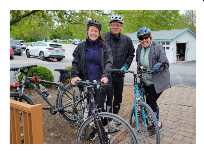
Defiance Ridge Winery Bike Ride—May 4