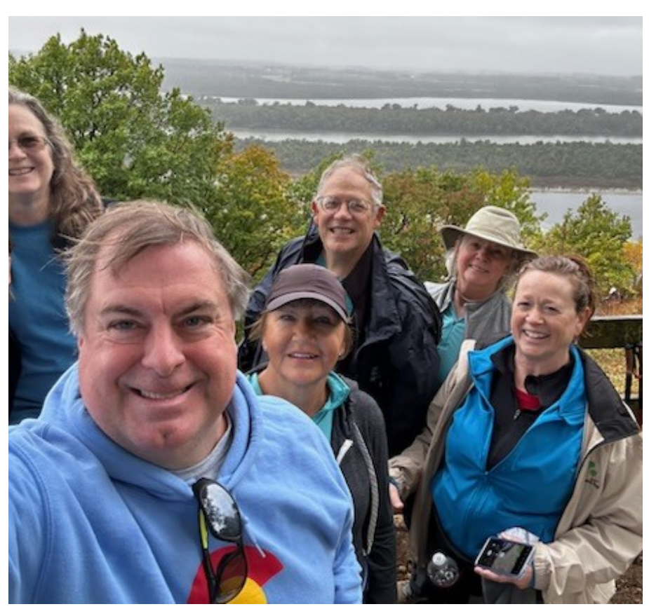
Hike at Pere Marquette State Park — October 14th