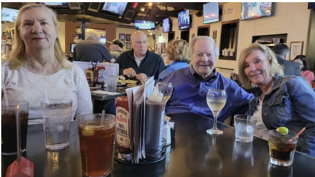
Happy Hour at Lester's—April 25