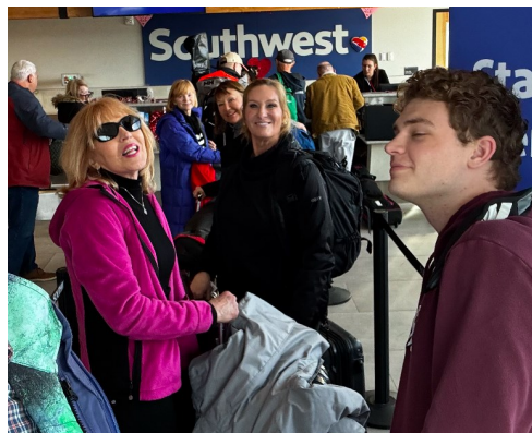
Heading home from the Montrose airport.