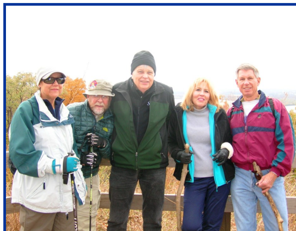
Hike at Pere Marquette State Park