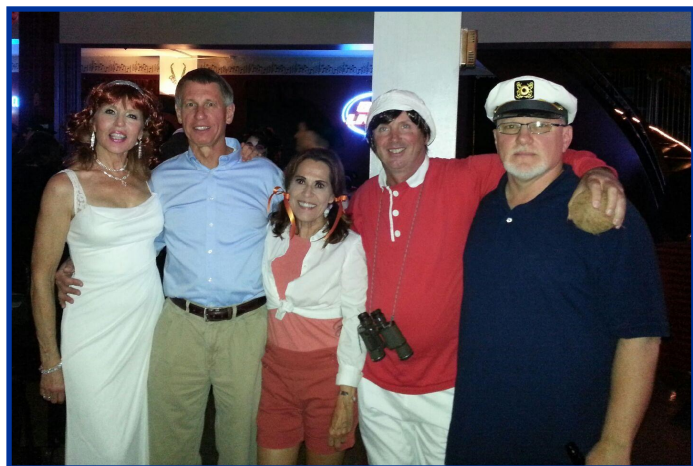
Halloween Party at Casa Loma