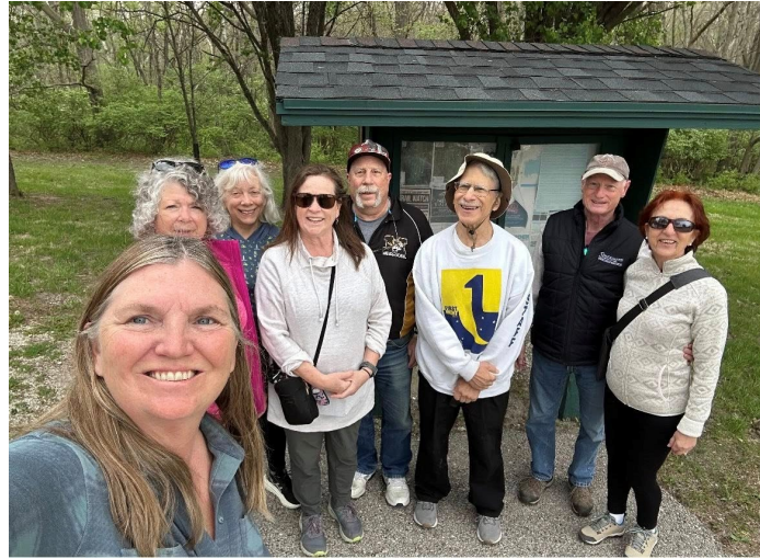
Hike at Queeny Park