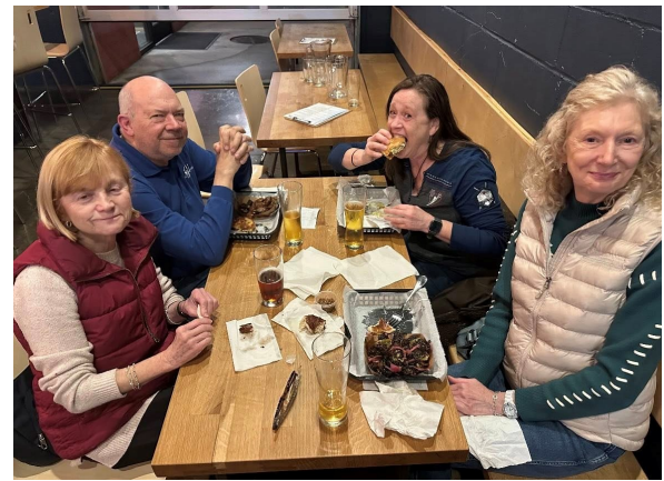
Happy Hour at Blue Jay Brewing