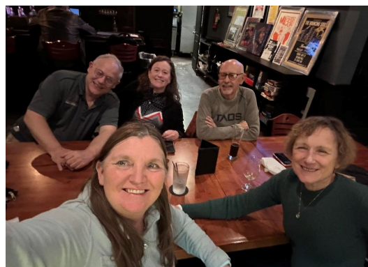
Happy Hour at Heavy Riff Brewery